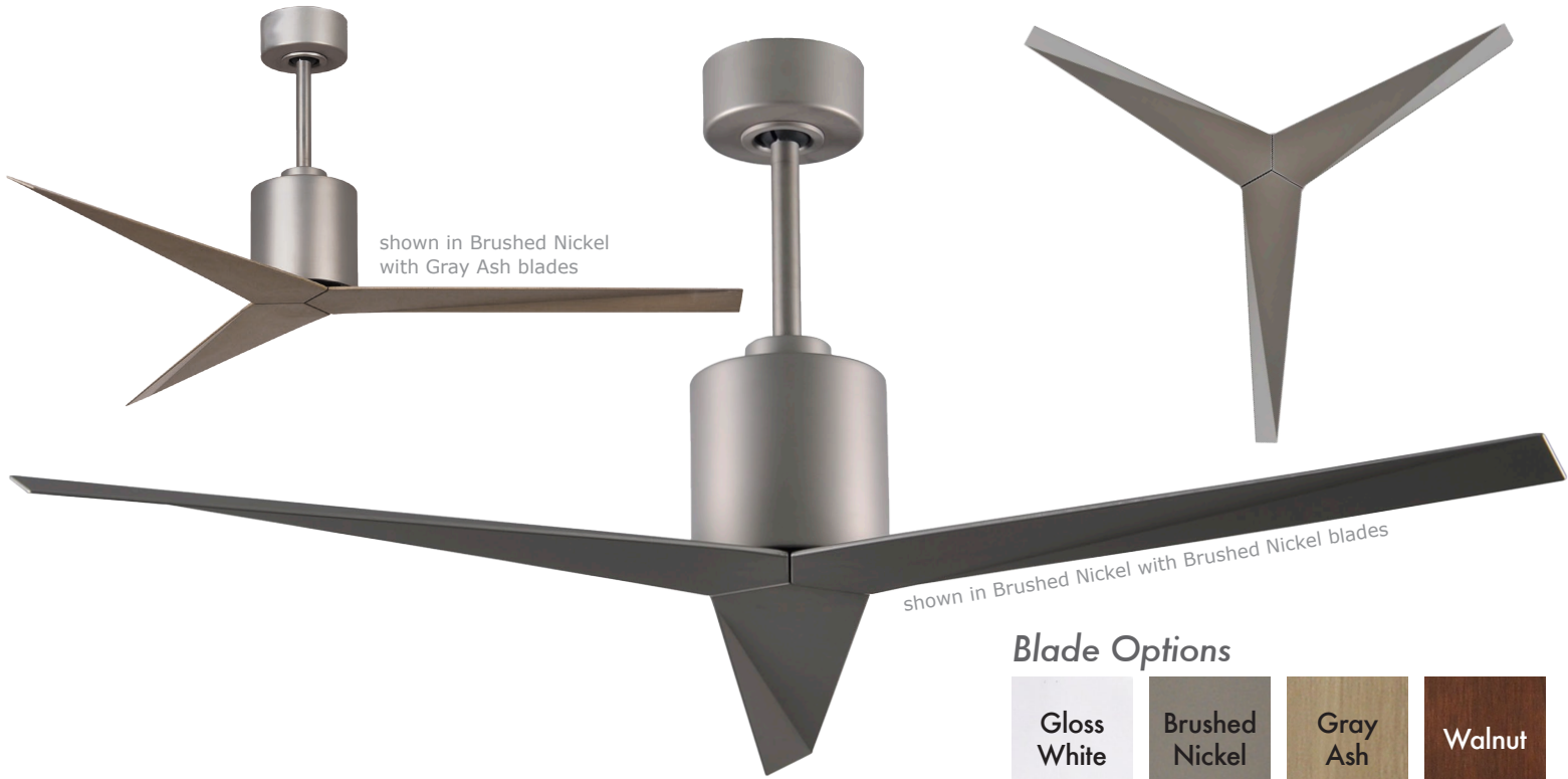
shown in Brushed Nickel with Gray Ash blades