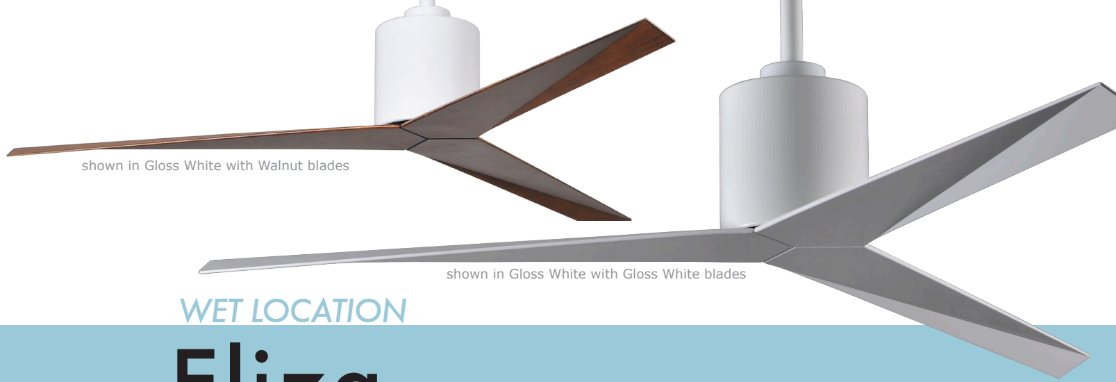
shown in Gloss White with Walnut blades